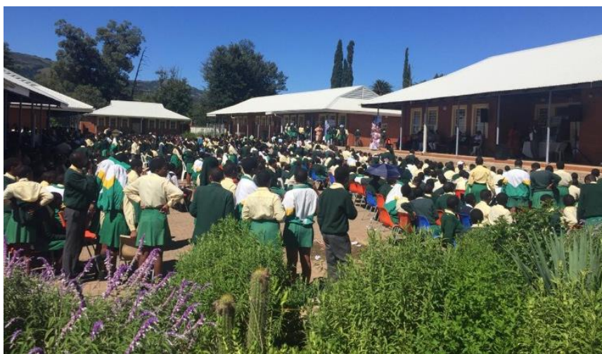
Figure 1: expo participants at Mvenyane High School enjoying live presentations of green career options

The school support programme will help establish GEMS (Green Economy Management Science) Clubs for students to focus on their areas of interests, where different skills set and activities will be further explored. It will also provide an IT facilitator to the Mvenyane school computer centre to develop basic computer literacy skills, of fundamental importance as all countries embrace the 4 th Industrial Revolution where digital and ICT is taking the center stage.