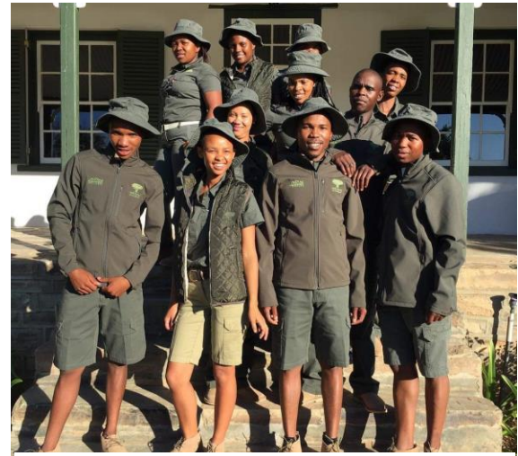
Figure 3: Herding Academy students from Matatiele show off their new outfits

An exciting element of the Ecofutures pilot lessons is upscaling the approach for use in the emerging national YES programme : WWF-SA and ERS have recruited 40 Ecofutures interns, supported by the First Rand Foundation, in an effort to reach more youth in the water source areas across the rural South African landscape. Another 80 interns will be included in the following two years, making a total of 120 youth ambassadors. The aim is that interns will become resources for their respective communities, able to generate income themselves as entrepreneurs, or have sufficient skills to become attractive as employees, while contributing to the local economy through their actions and careers, including as livestock farming and support, bee-keeping, biomass processing (charcoal, biochar, fodder, etc)